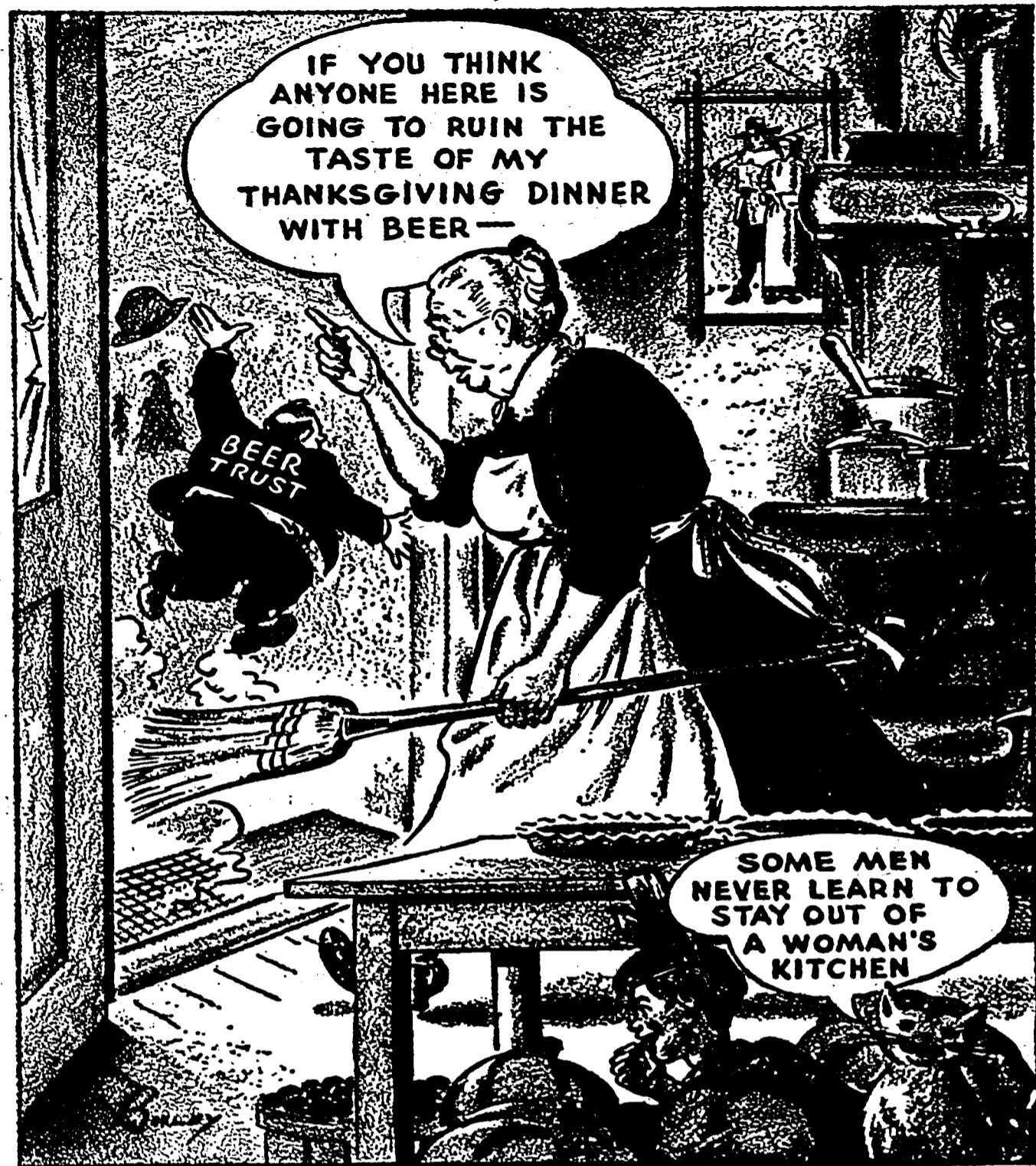
THE PIONEER SPIRIT