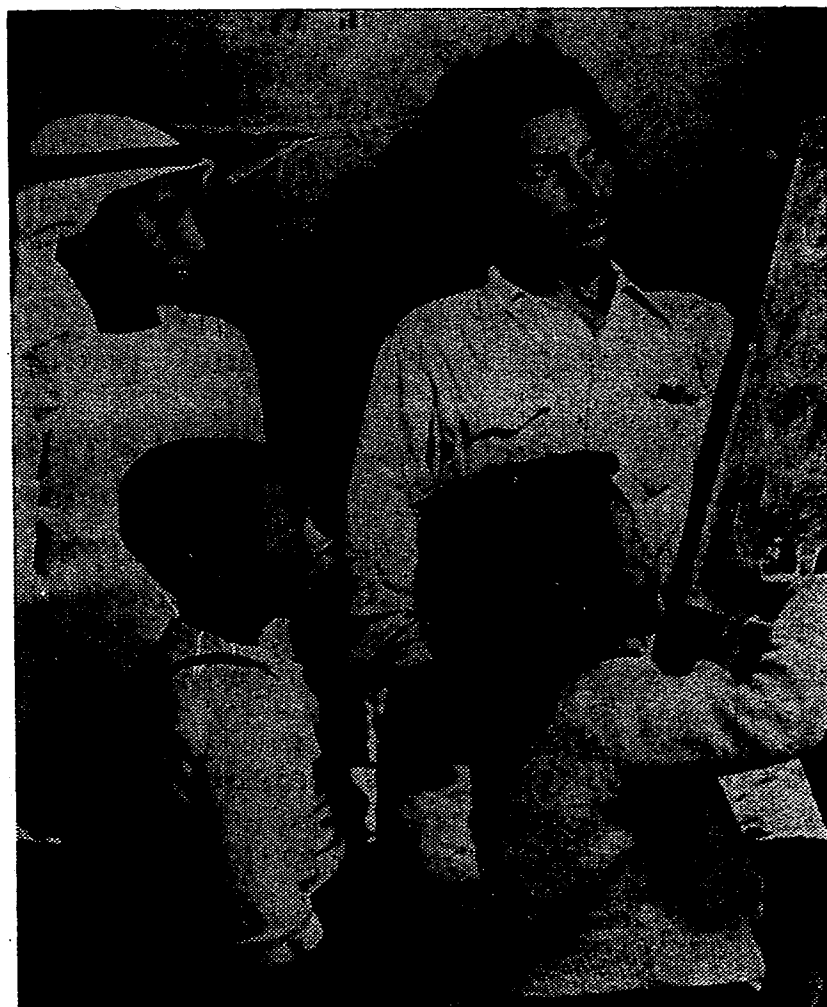
New Sweaters Make School Pleasant

It was cold in the tent and cold outside. Her clothes were damp as she put them on.