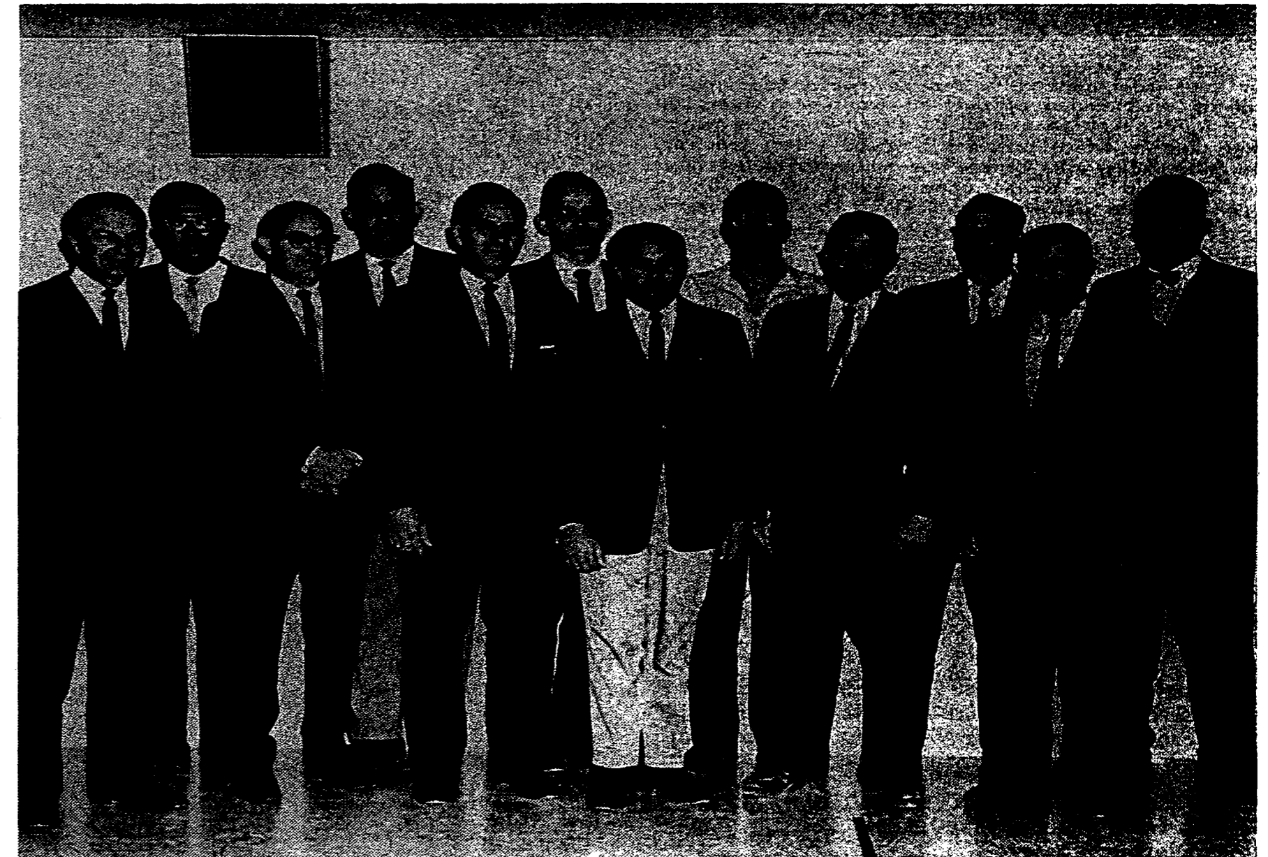
Western U. S. Area Spiritual Retreat Held at North Loup, Nebraska, May 3-9.