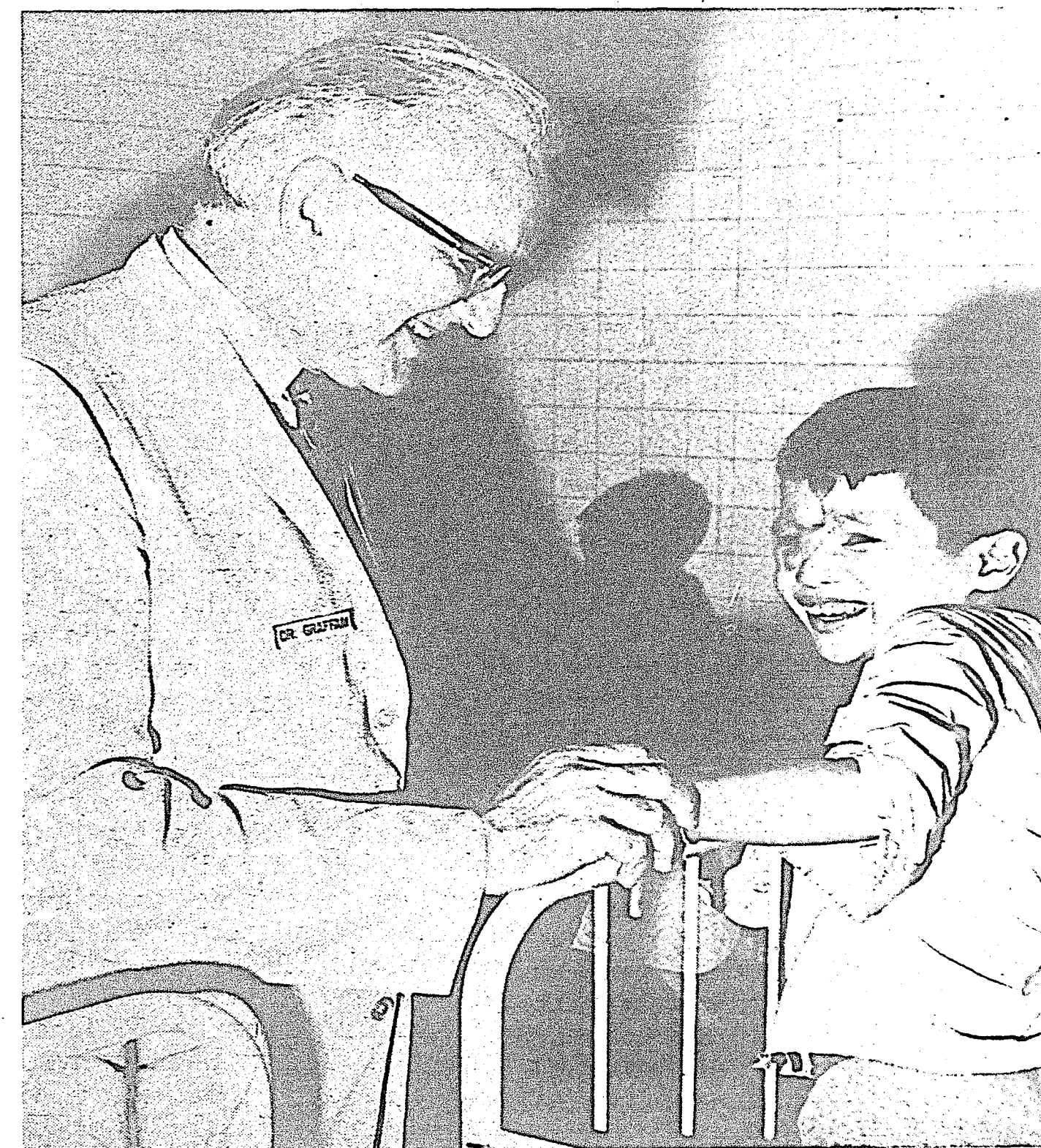
Mission of Mercy in Vietnam