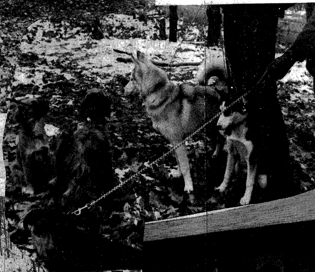
Superabundance of dogs (and cats)