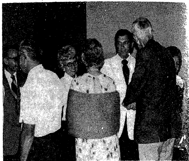
The president's reception

Paul was aware of the confusion that was rampant then, as now, and he determined not clarify the issue with the message that he had received from the Lord. It is recorded in 1 Thess. 4:13-17. "Now