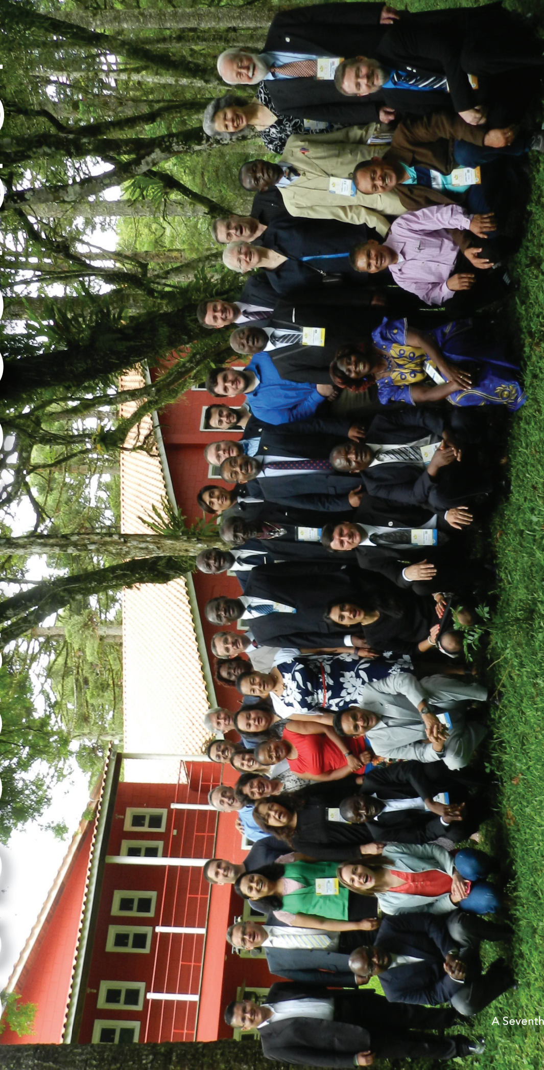
Seventh Day Baptist World Federation Eighth Session, January 22-28, 2017 Curitiba, Paraná, Brazil