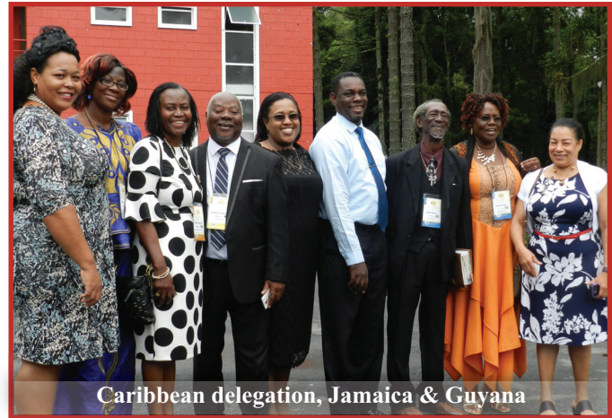
Caribbean delegation, Jamaica & Guyana