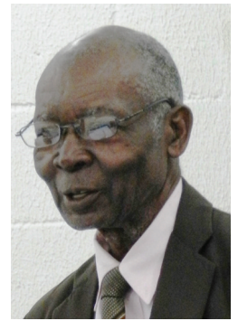
Naval Harley Jamaica