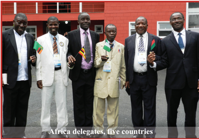
Africa delegates, five countries