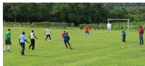
Soccer (futebol) happens any time of day.