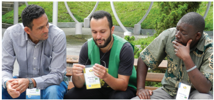
A green-vested translator between two people marks a conversation in at least two languages.