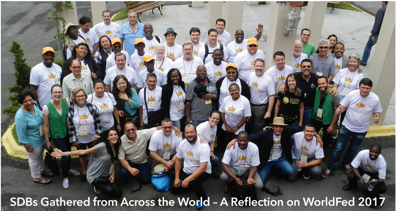
SDBs Gathered from Across the World – A Reflection on WorldFed 2017

I was privileged, in January 2017, to attend the 8th Session of the Seventh Day Baptist World Federation (SDBWF) held in Curitiba, Brazil, under the theme “The Kingdom of God is Like...” Permit me to reflect on that global gathering of SDBs.