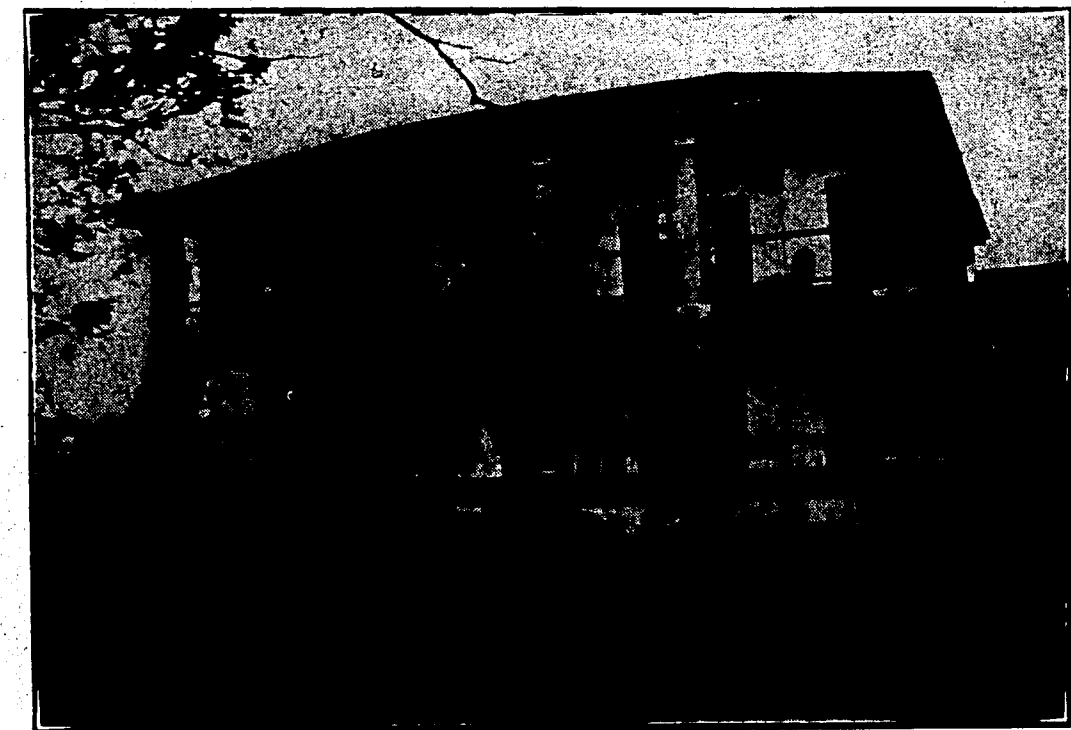
SEVENTH-DAY BAPTIST MISSION, SHANGHAI, CHINA.